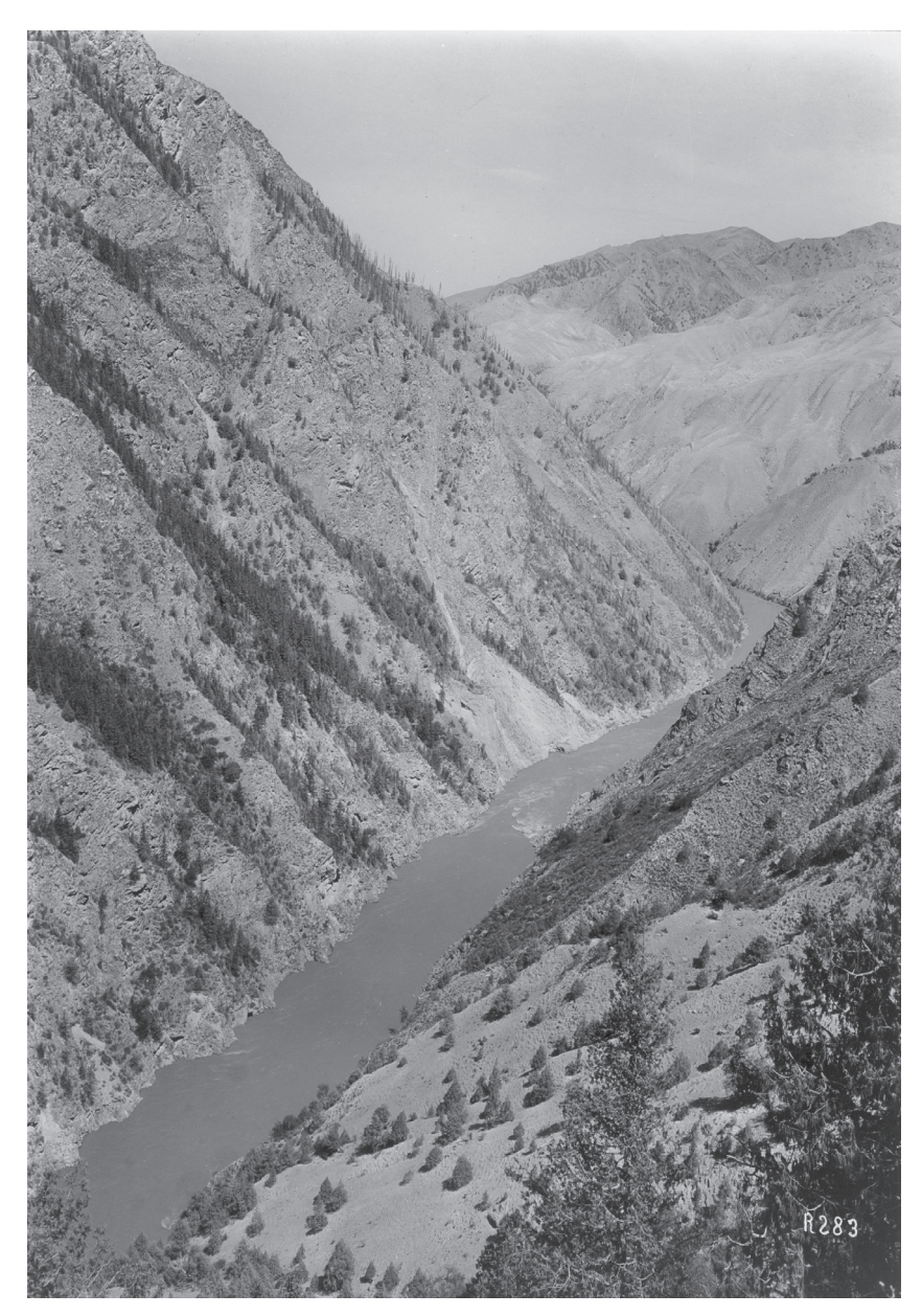
58 (p. 176) The Yellow River looking down stream west of Ra-gya from a bluff on the spur which intersects Hao-wa and Nya-rug valleys, elevation 10900 feet. Picea asperata Mast., to left and Juniperus Przewalskii Kom. on the opposite slopes. In immediate foreground right, Juniperus tibetica Kom. A rapid can be seen in middle distance.