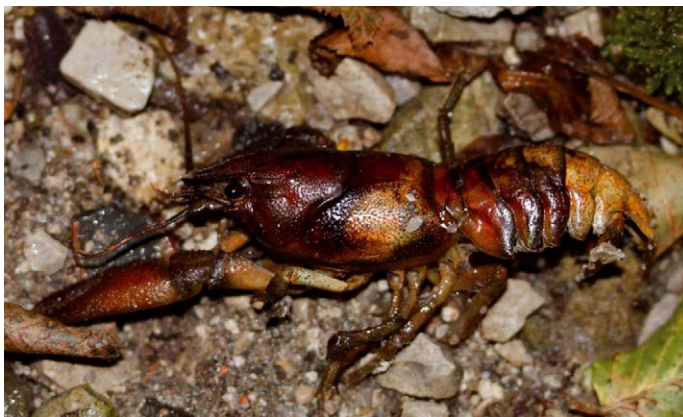
Figure 4 – Dead white-clawed crayfish, San Michele creek, 26 July 2013.