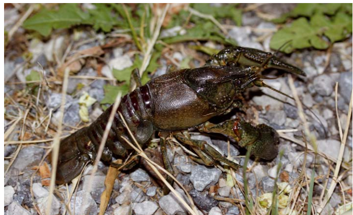
Figure 8 – An individual (100 mm long) of the spiny-cheek crayfish, San Michele creek, 30 July 2013.

of white-clawed crayfish ( Austropotamobius pallipes ) population during a crayfish plague outbreak followed by rescue. Knowledge and Management of Aquatic Ecosystems 417: 1.