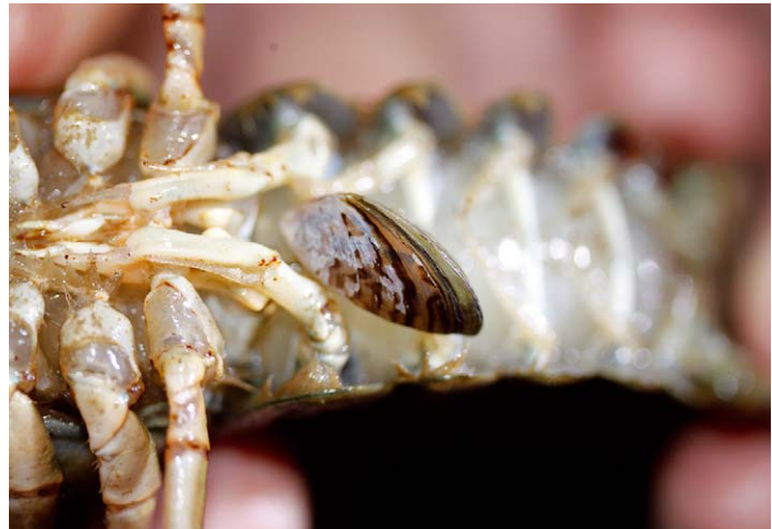
Figure 7 – Spiny-cheek crayfish male with D. polymorpha , San Michele creek, 26 July 2013.