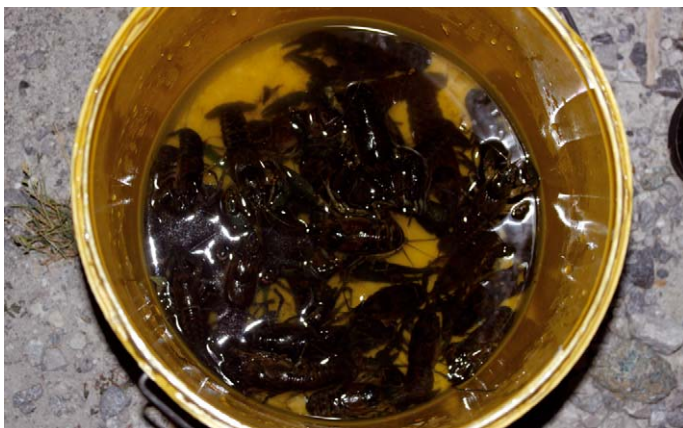
Figure 6 – Some individuals of the spiny-cheek crayfish, collected in the San Michele creek, 26 July 2013.

threat for the native European species (Holdich et al. 2009; Oidtmann 2012). Indeed, the transmission of the crayfish plague pathogen can occur via the movement of infected specimens, or through contaminated water or equipment (Oidtmann 2012). The pathogen can also be transported through the digestive tracts of cold-blooded animals (Svoboda et al. 2016). In addition, crayfish predators (mammals, birds and fishes) can carry infected hosts to other water bodies (Evans & Edgerton 2002; Svoboda et al. 2016).