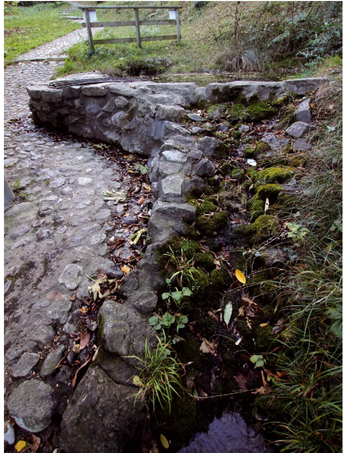
Figure 2 – The San Michele creek spring.

We report the sudden extinction of a population of the A. pallipes complex in a mountain PA. We hypothesize that the extinction of this species complex was immediately successive to the illegal introduction of the spiny-cheek crayfish O. limosus , and that the pathogen A. astaci was responsible for the mass