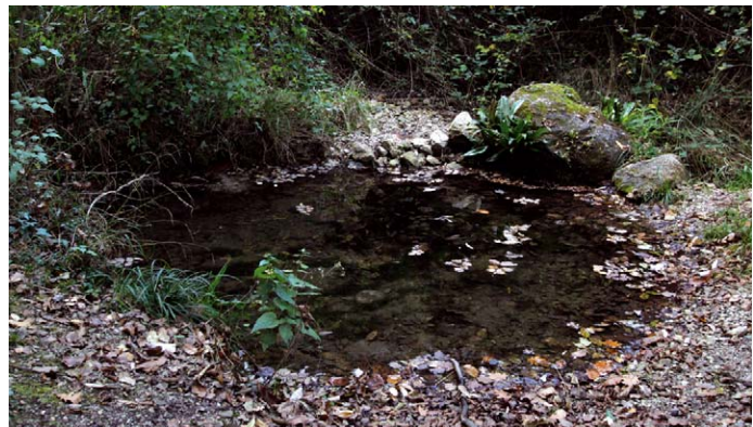
Figure 3 – The pool with permanent water, San Michele creek.

mortality of all the native crayfishes present in the isolated creek. The similarity in size of the recorded O. limosus individuals, the occurrence of a typical lake species such as D. polymorpha attached between the gonopods of a male, and the sudden appearance of the invasive species could indicate that a deliberate introduction occurred. Some individuals of O. limosus were 100 mm long or more (Figure 8). Based on their size, various individuals were considered to be of reproductive age.