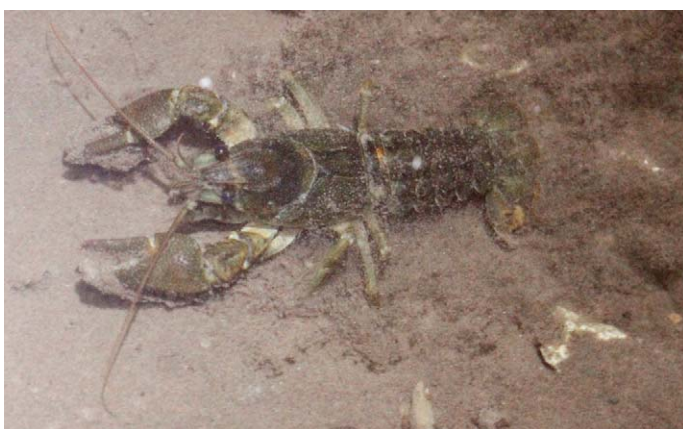
Figure 5 – Moribund white-clawed crayfish, San Michele creek, 26 July 2013.