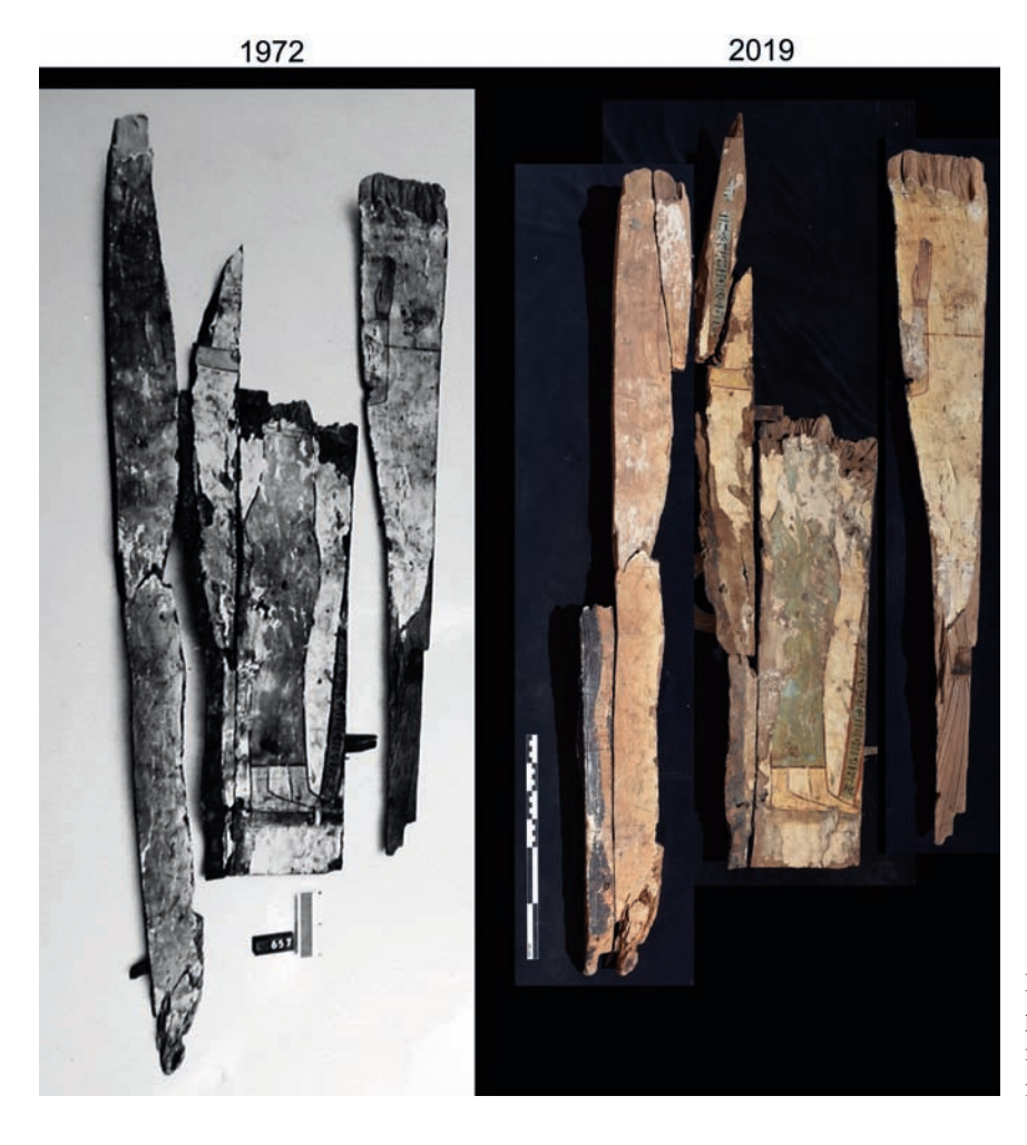
Fig. 2 Comparison of black and white photo and new photographic documentation of inner side of coffin fragments Reg. 657.

the Ankh-Hor Project. The large-scale conservation program will be continued in the upcoming seasons.