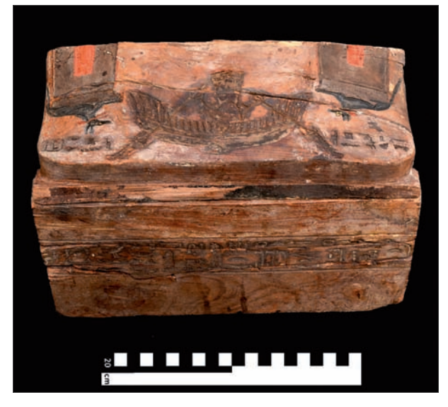
Fig. 8 Foot part of inner coffin of Pa-di-Amun-neb-nesut-tawy I, Reg. 607.