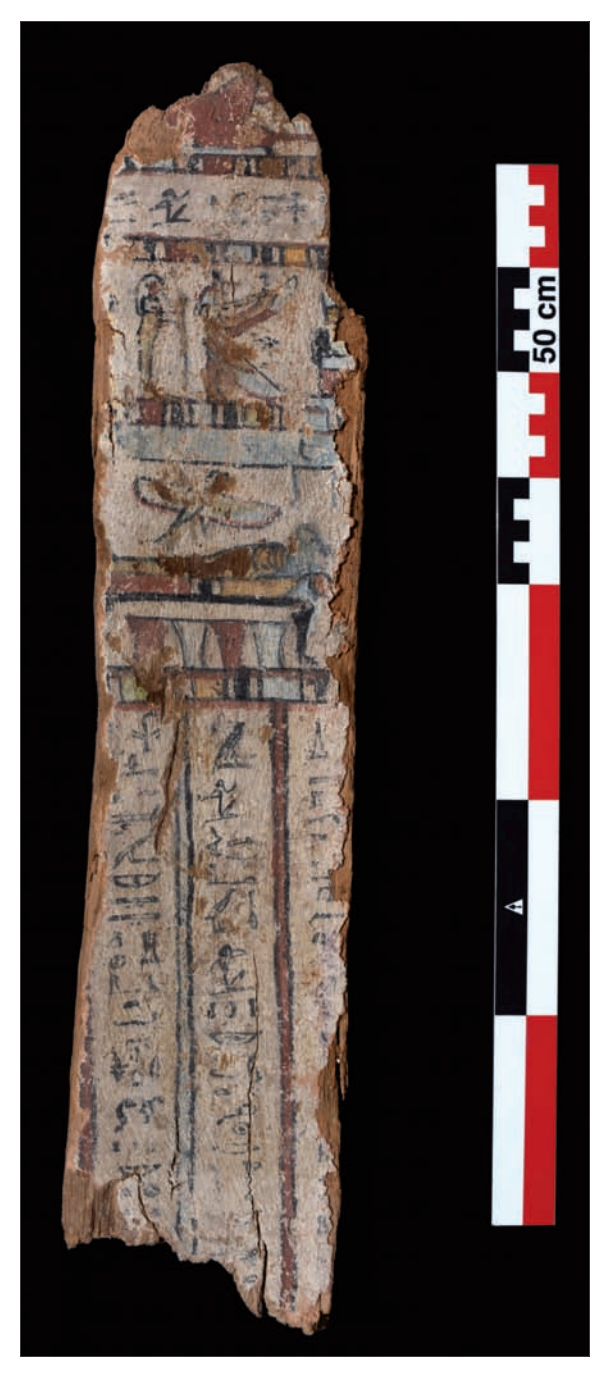
Fig. 3 Fragment of inner anthropoid coffin of Ankh-Hor, Reg. 537.

out due to a very ephemeral painting of low quality – is this due solely to the premature death of the tomb owner, similar to the unfinished state of the underground cult complex? Lack of time, cost savings or simply inadequate execution and low valence – the inner coffin was not a "visible" pres-