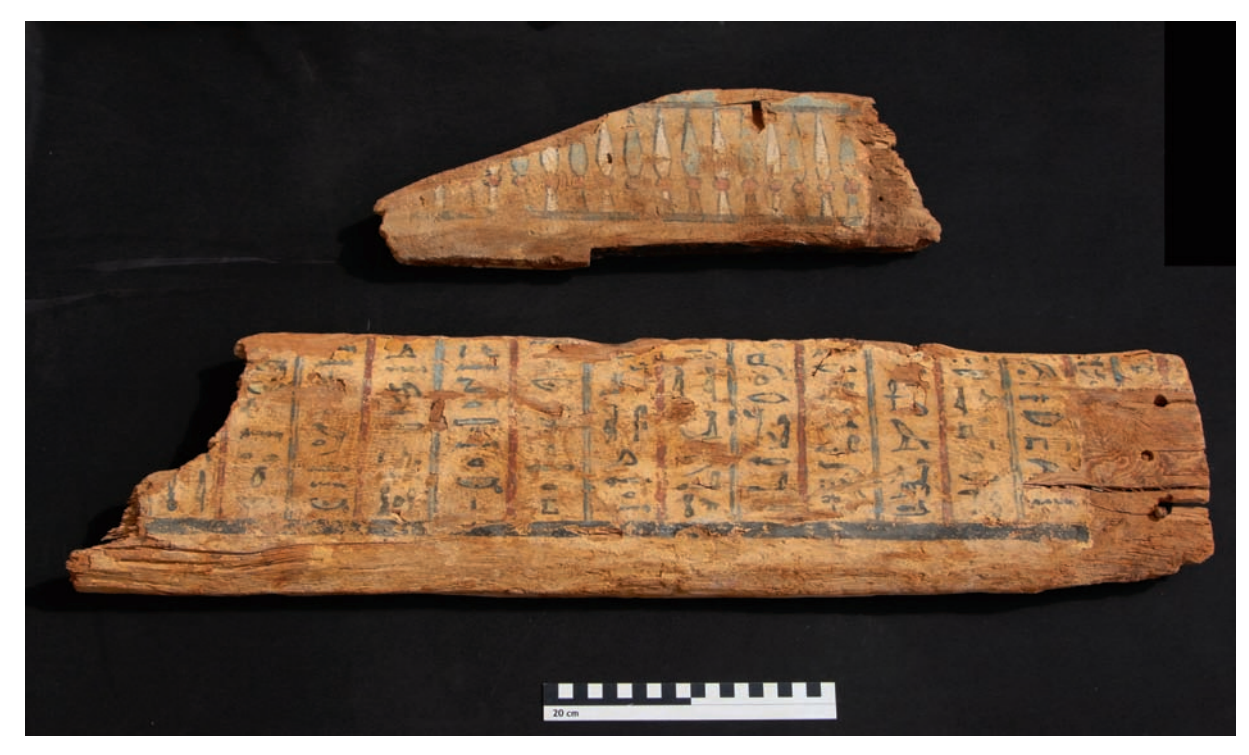
Fig. 4 Board of qrsw coffin of Merit-Neith, Reg. 377b (bottom) and a new match found 2018 (top).