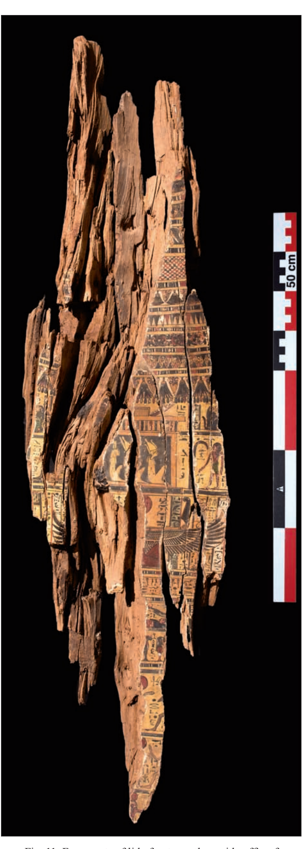
Fig. 11 Fragments of lid of outer anthropoid coffin of Aset-em-Akhbit, Reg. 869.