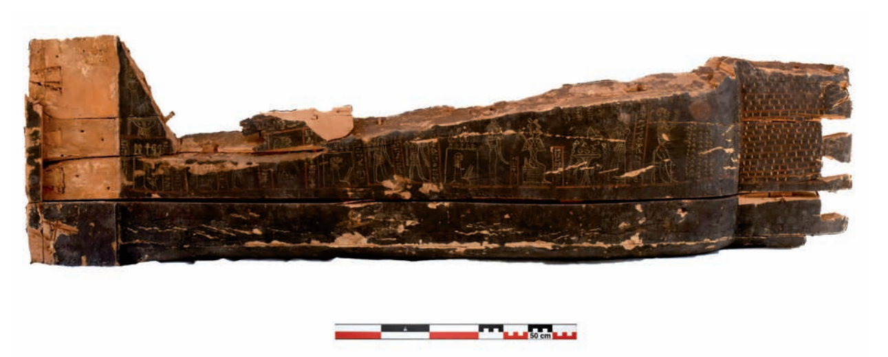
Fig. 13 Outer anthropoid coffin of Tut, Reg. 510.