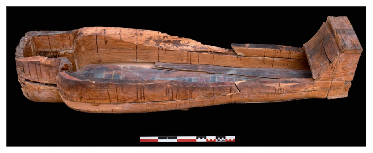
Fig. 10 Inner anthropoid coffin of Aset-em-Akhbit, Reg. 613.

(13. wi)^{50} and his family. Only few fragments from the actual burial of Pa-di-Amun-neb-nesut-tawy I have survived. Reg. 607 is his inner (Fig. 8) and Reg. 680 (Fig. 9) his outer anthropoid coffin. The inner anthropoid coffins of some family members are much better preserved. Reg. 613 and Reg. 614 fall into the same type as Reg. 607 and are polished natural wood coffins with carved decoration datable to the 30<sup>th</sup> Dynasty and the early Ptolemaic era. The remains of a Book of the Dead papyrus inside the coffin for Reg. 614 are remarkable.<sup>51</sup> Reg. 613 (Fig. 10), belonging to a lady with the name Aset-em-Akhbit,<sup>52</sup> which was completely cleaned and consolidated in 2019, is of interest because fragments of the lid of its outer anthropoid coffin were also found (Reg. 869, Fig. 11). Unfortunately, this coffin is very fragmented and only a central part of the lid has survived. The outer side of the lid of Reg. 869 shows common scenes known from Late Period coffins and a design with a large flower collar, a depiction of the goddess Nut on the breast and the bier scene with the mummy on the bed. The inner side of the lid is decorated with female and male figures representing the hours of day and night on a light blue background.<sup>53</sup> All in all, the coffins datable to the 30<sup>th</sup> Dynasty from TT 414 are important links between the coffin ensembles from the 26th Dynasty and