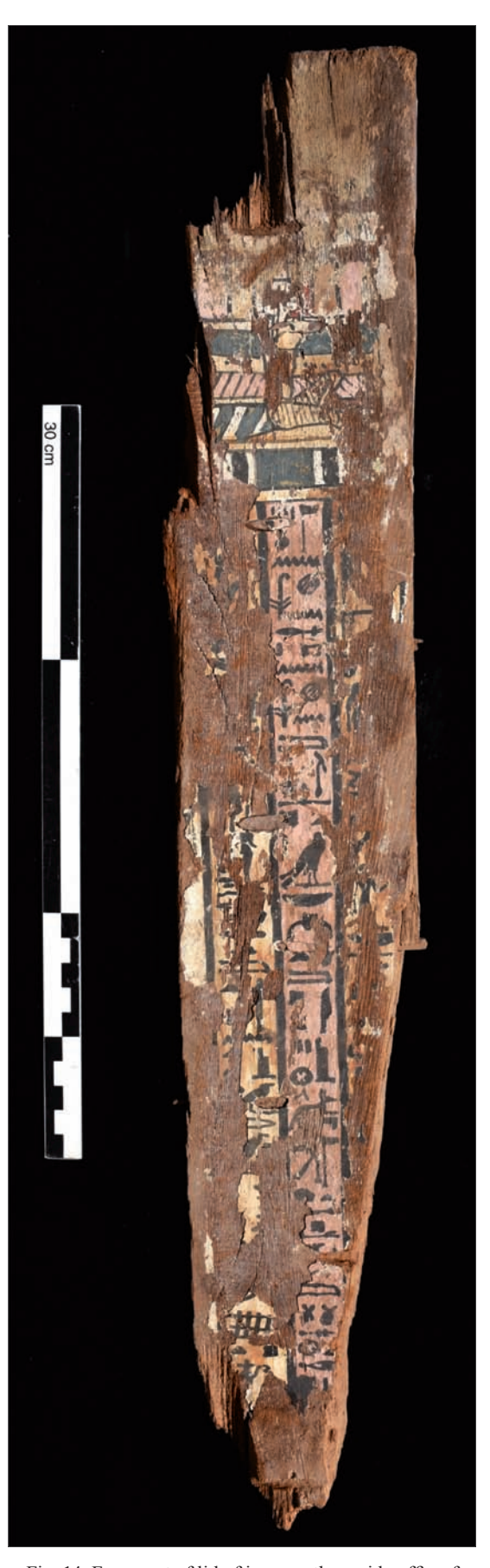
Fig. 14 Fragment of lid of inner anthropoid coffin of Ta-Khonsu, Reg. 800.