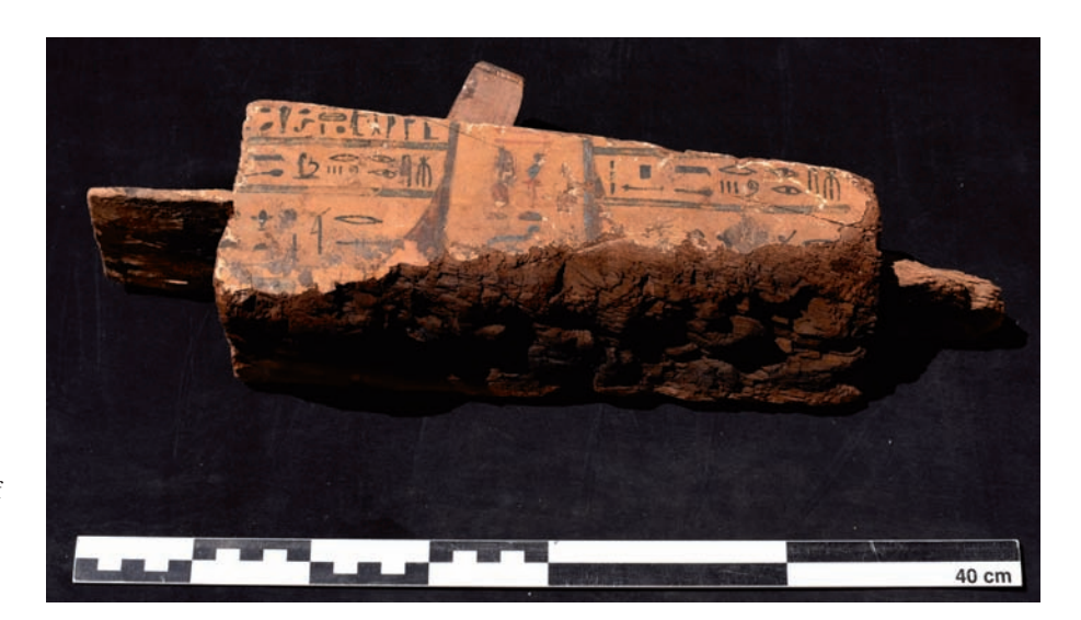
Fig. 12 Remaining fragment of foot board of inner anthropoid coffin of Ta-remetj-Bastet, Reg. 661.

Reg. 510 belonged to a male person with the name Tut of whom no titles are preserved, and his mother is unknown.<sup>66</sup> However, his father Djehutirdis was also buried in TT 414, in a very similar outer coffin (Reg. 514) and a colorfully painted inner coffin (Reg. 524). Djehuti-irdis allows the connection of this family with the wider family of Mut-Min.<sup>67</sup> The genealogical data suggest a dating of the death and burial of Tut around 150 BCE.