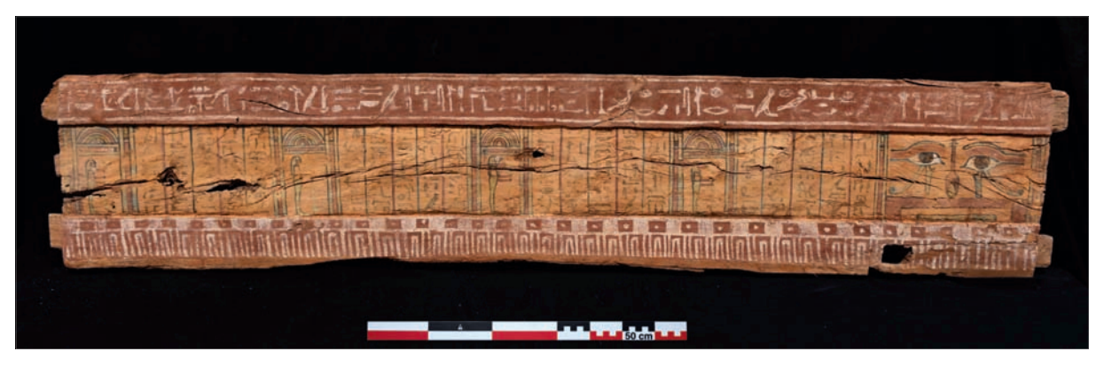
Fig. 5 Board of grsw coffin of Psametik-men-em-Waset II, Reg. 595.

tions of the solar barque.<sup>37</sup> It belonged to Her-Aset, possibly a sister-in-law of Ankh-Hor.<sup>38</sup>