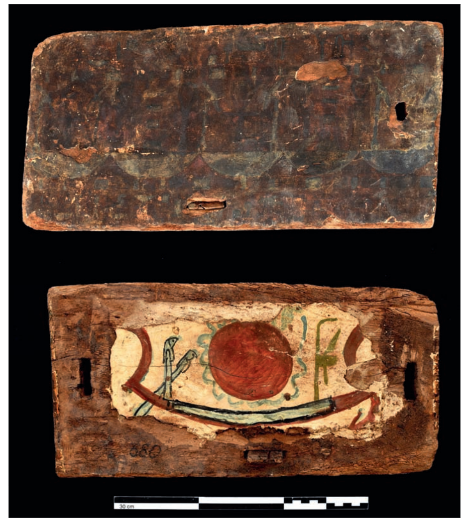
Fig. 9 Foot part of outer anthropoid coffin of Pa-di-Amun-nebnesut-tawy I, Reg. 680.