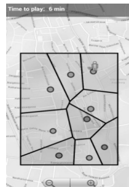
Fig. 1: Screenshot of a possible winning configuration for team “orange”

game is to occupy virtual areas moving around outdoor on a real world gameboard. The board and the position of the team are displayed as a semantic overlay of a map on the screen of the mobile device which each team uses. The players have to find certain geographic locations on site to occupy these areas, i.e. the areas are marked in the colour of the specific team after they have solved a game task and are not accessible to the other team any more. Areas are derived from defined locations by attaching all points in space that are closer to that specific location than to any other, to a centre location (Voronoi segmentation). For the purpose of balancing the game temporarily at each location, a specific task must be solved to occupy the area (cf. KIEFER et al. 2007). This task can be knowledge-based, it can be verbalized as an exploration task, or it can meet the function to collect (subjective) geo-data, e.g. referring to the quality of one's stay in a certain place. With these or other location-based data, maps can be composed in the post-processing stage. A combination of multiple tasks in one location is also possible. Each team can view on their screens the areas already occupied by the opposing exteam, and therefore must adapt their strategic decisions. In one of the possible game configurations the team which conquered the largest area wins (see fig. 1). It is advisable to subordinate the game with all its content under a geographical central question or central topic.