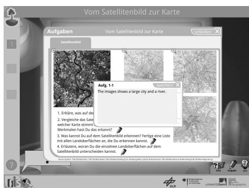
Fig. 1: Learning module and user interaction by typing in answers to a question

The learning modules are available for download, including a didactic commentary and background information. Additionally, all interactive learning modules can be executed online. Accordingly, the provided learning material includes multi-media applications and allows a high degree of interaction. Moreover, specific tools for research, analysis and exchange are integrated, thus independent working and discovery-based learning is encouraged in terms of a practice-oriented approach. By imparting knowledge about remote sensing with interactive learning modules combined with research tools for individual learning, the FIS learning portal addresses aspects that are not covered by knowledge portals like DLR_next ( http://www.dlr.de/next/ ), ESA kids ( http://www.esa.int/esaKIDSde/ ), or SEOS ( http://www.seos-project.eu/home.html ), which focus on the provision of information through didactically prepared texts and images.