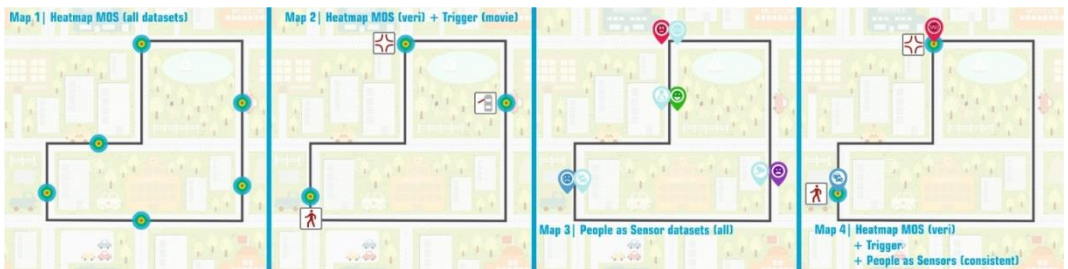
Figure 2: Schematic maps for identifying potential danger spots, combining datasets collected from all participants