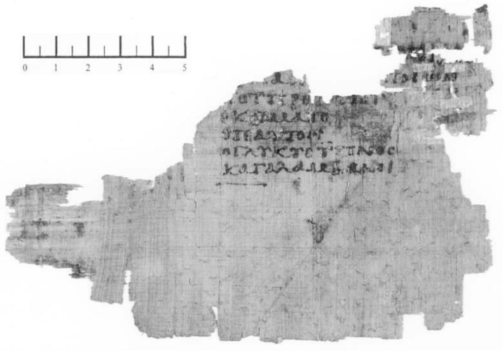
P.Vindob. G 26221 v