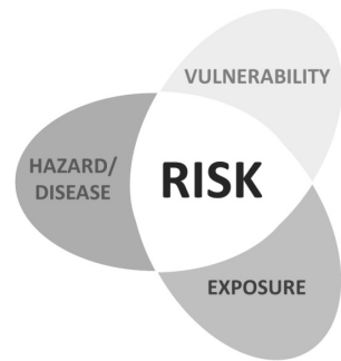
Fig. 1: Risk framework