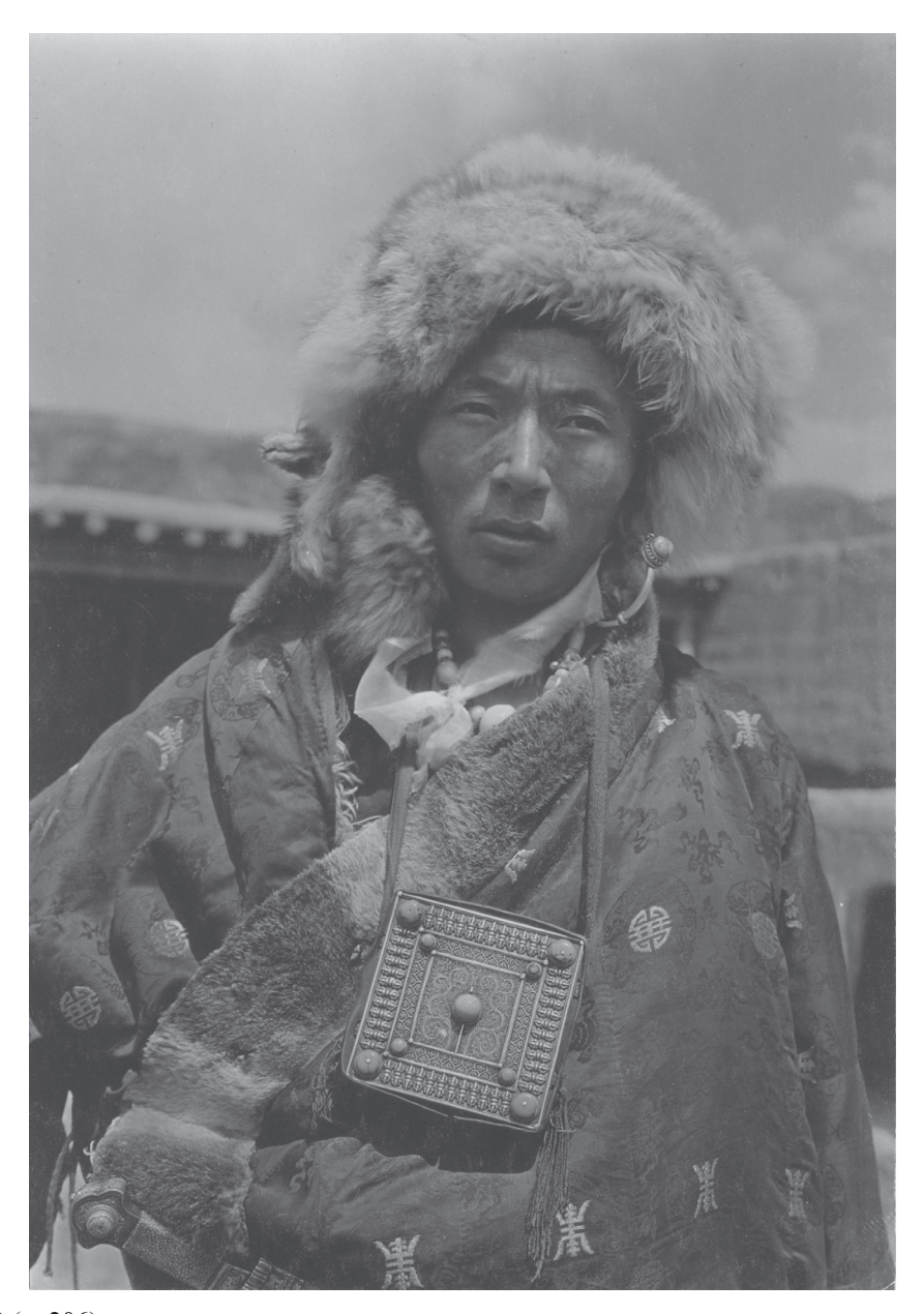
82 (p. 206) The chief of the Bu-tshang Go-log, his encampment is south of the Ri-mang Go-long and west of the Nga-ba tribe, south of the Yellow River. He wears a rich blue satin brocade with gold designs, trimmed with otter skins, and on his head a fox skin. Around his neck is a fine silver charm box studded with turquoise and coral.