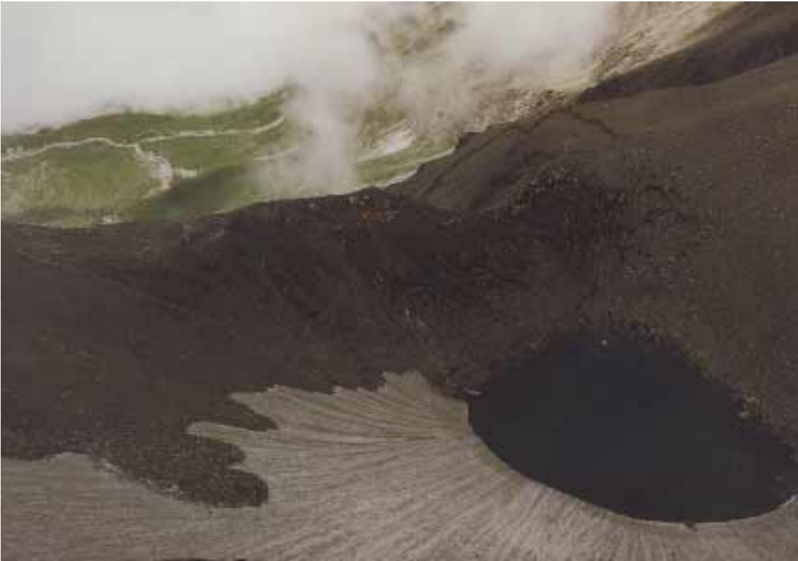
The “mystery lake” of Rūpkunḍ, seen from above. Normally the lake is frozen, but during the Royal Progress in 1987, the ice had melted. Note the pilgrims and their birchbark parasols on the shore of the lake.

Opposite Pilgrims climbing from Pātar Nacaunṅyām to Kailavināyak Pass. The peaks of the Great Himalayan range are visible in the background.