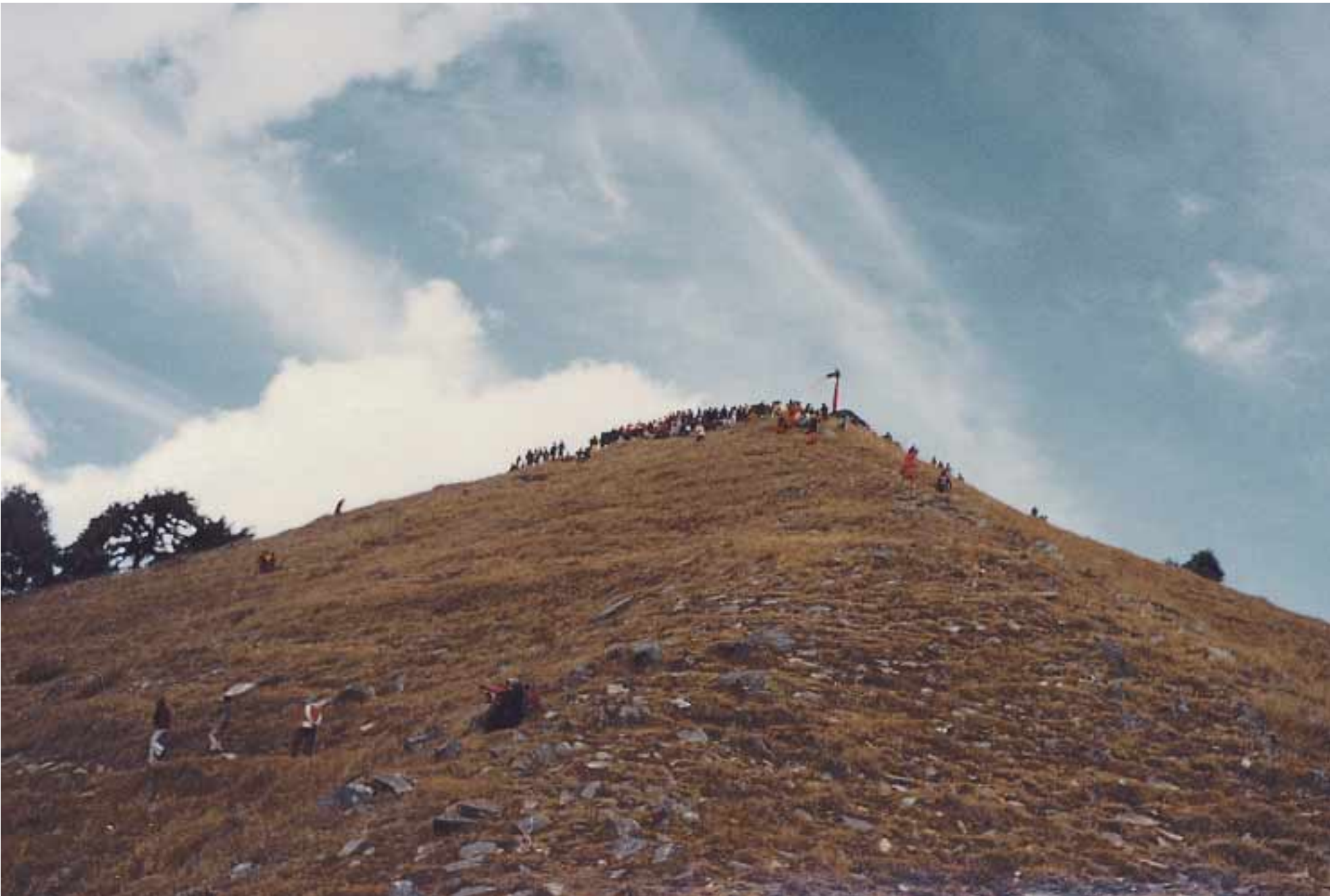
The culmination of the Ghaṇḍyāl jāt on 25 December, 1984. The god's nišan is clearly visible on the mountaintop.

daughters' marital homes as possible, and the route traversed the four paṭṭīs of Kandarsyum, Chandpur, Dhaduli and Bachansyum, which constitute the effective limits of the marriage networks of the Khand villagers. Upon arrival at some village, each family would offer Rs. 1