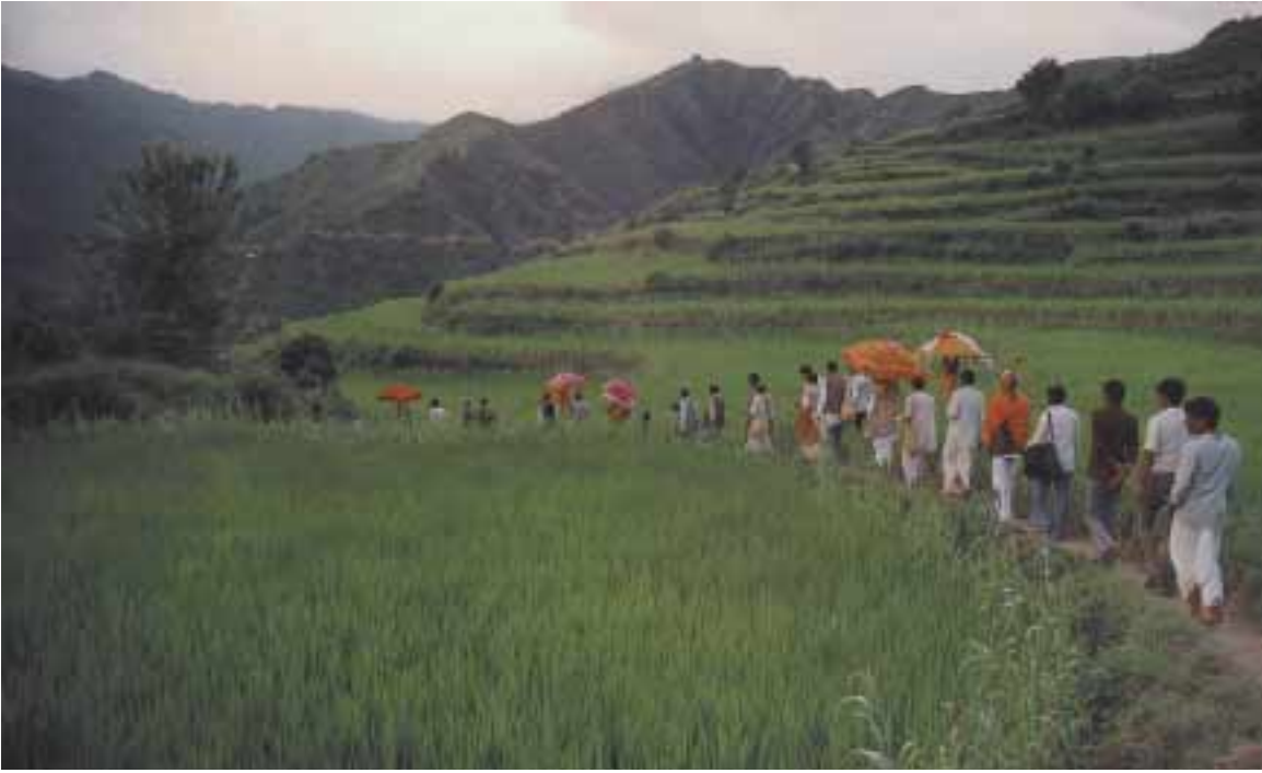
Pilgrims on the Royal Progress at the end of the rainy season in 1987. One can see several parasols signifying the lineages of the “Twelve-Place Brahmans”, who are believed to have accompanied the original king of Garhwal when he came to Garhwal from Western India.

“house of filth” ( malīc kā koṭhā ), is smeared with ash, wears a loin-cloth ( langoṭī ) made of stone, and tends a fire ( dhuni ) in a cremation ground, where he wears the shrouds and eats the flesh of the dead. Ghaṇḍyāl is primarily associated with Rajputs, but they are khaśa Rajputs of particularly low status. “ Khaśa ” is a vexed term, and its application to certain Rajput and Brahman castes in the Central Himalayas has not gone unchallenged 10 , but that debate need not detain us here. Suffice to say that whatever the historical origins of the category, it has real social force in this region, and the followers of Ghaṇḍyāl are widely regarded as khaśa . The four paṭṭīs in which the deity wanders are (with the exception of certain parts of Chandpur) fairly remote, with few roads or schools, and little political clout. The people of Kandarsyum in particular are belittled by other mountain folk for their archaic dress and speech, and their “backward” ways. Ghaṇḍyāl’s priests were from the pajāi and bheḍā castes, explicitly regarded by everyone (including themselves) as khaśa Rajputs.