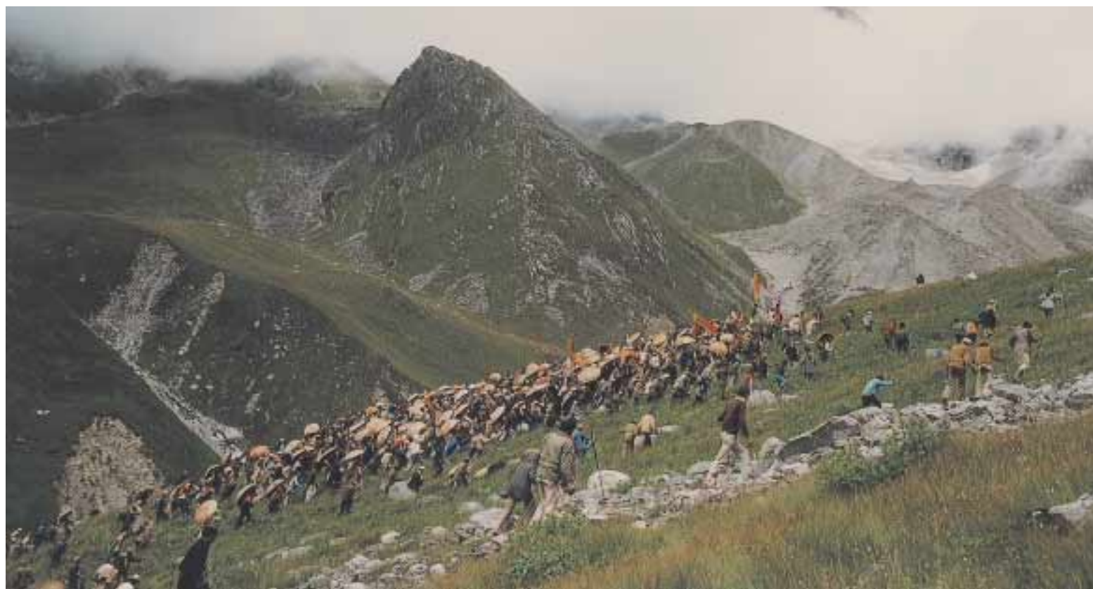
Pilgrims climbing from Śilā Samudar, “the ocean of rock”, to their ultimate goal of Homkuṇḍ, at the culmination of the Royal Progress in 1987

lower, downstream half of Singtur, while the Kauravas ( ṣāthī , ṣaṣṭhī ) 16 live in the higher and wilder regions. Within Singtur, each of the sub-districts is again divided in two, and king Karṇa’s temple is located where all four land divisions come together, in the village of Dyora in the “Middle Land” ( mājī thok ). This pattern is repeated on a larger scale, with the residents of Singtur paṭṭī collectively classed as pāmsyā while residents of the paṭṭīs of Panchgain and Adaur, adjacent to but higher than Singtur, are ṣāthīs ruled by Duryodhana.