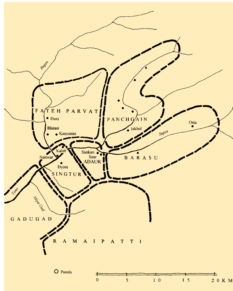
Divine kingdoms in the upper basin of the Tons river: delineation of the territories (paṭṭi), of Karṇa (Singtur) and Duryodhana (Aaur, Panchgain and Barasu).

Throughout this essay I have argued that the “sacred” aspects of these central Himalayan religious cults cannot be understood without taking practices into account. The way in which Bhairava’s cult spreads, the routes taken by Ghaṇḍyāl and Jākh, the songs and rituals of Nandā Devī, the public confrontations of Karṇa and the other divine kings of the Western Himalaya – all of these have to do with kinship and territory, not as imagined or theorised, but as practised. Divine power is among the most important and highly valued aspects of these cults, but it must be understood in terms of society, politics, kinship, and territory. It exists only in a human context: women who need shelter, families who need cash, farmers who need rain. Any adequate description of these cults and processions must therefore recognise both that “the sacred” is an important dimension of them, and that this term can only be understood in the context of human practice, rather than as a transcendental category. But what of the practices of the gods themselves? The divine kings of Rawain, Karṇa and Duryodhana, also have their gods, and these are the great gods of Hinduism. When Karṇa and Duryodhana go on pilgrimage, they visit the pre-eminent local sacred places, Badrinath and Kedarnath. Their pilgrimages, like their processions, are clearly related to society and politics, and particularly to Rawain’s gradual integration into the wider society.