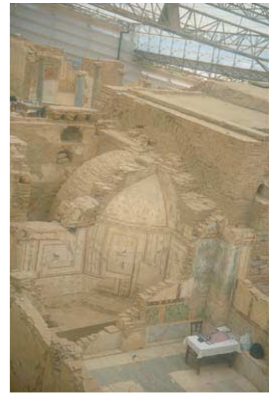
58.3: Blick in WE 4, Hof 21, Raum 22 und 23