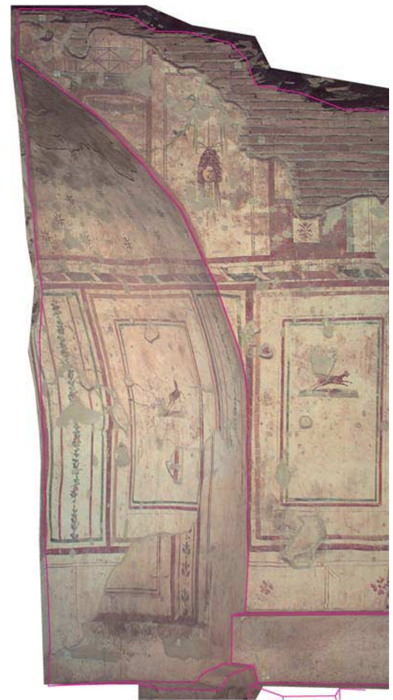
59.2: Orthophoto Raum 22, Apsiskuppel Nord