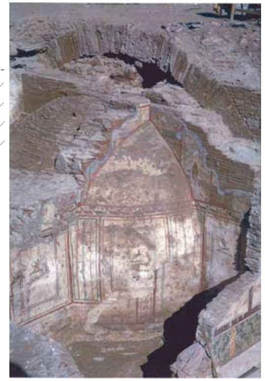
58.2: Raum 22, Apsis, Grabungsphoto