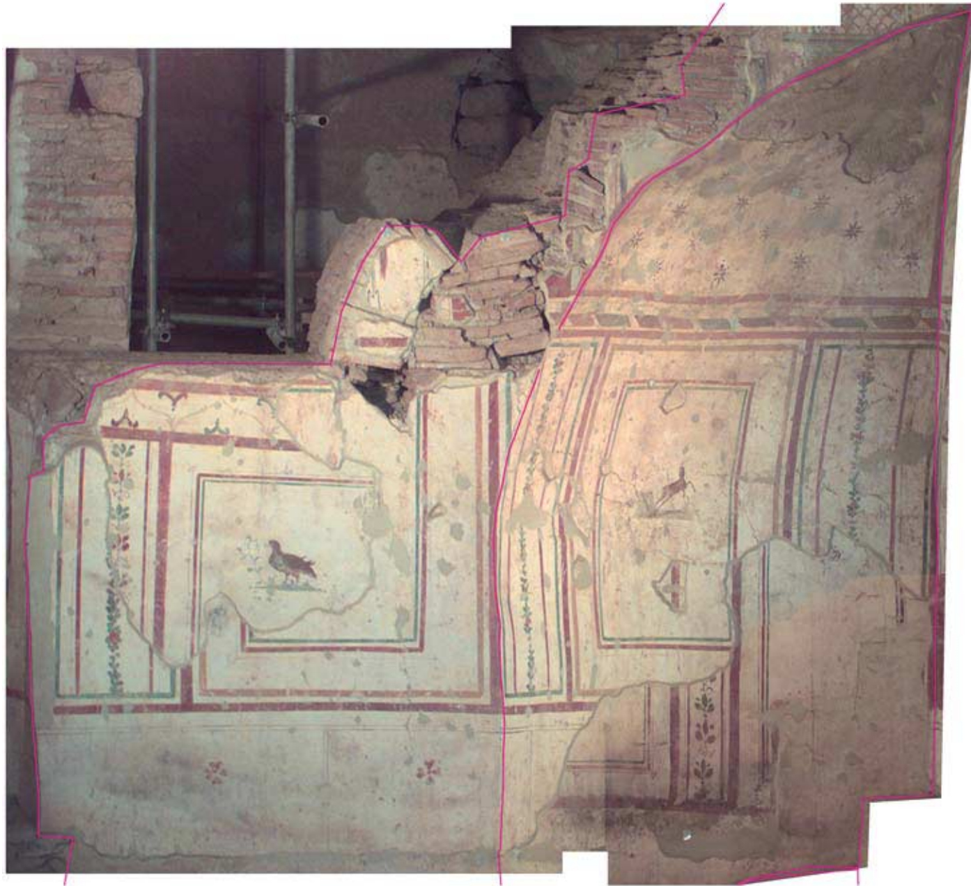
59.1: Orthophoto Raum 22, Apsiskuppel West