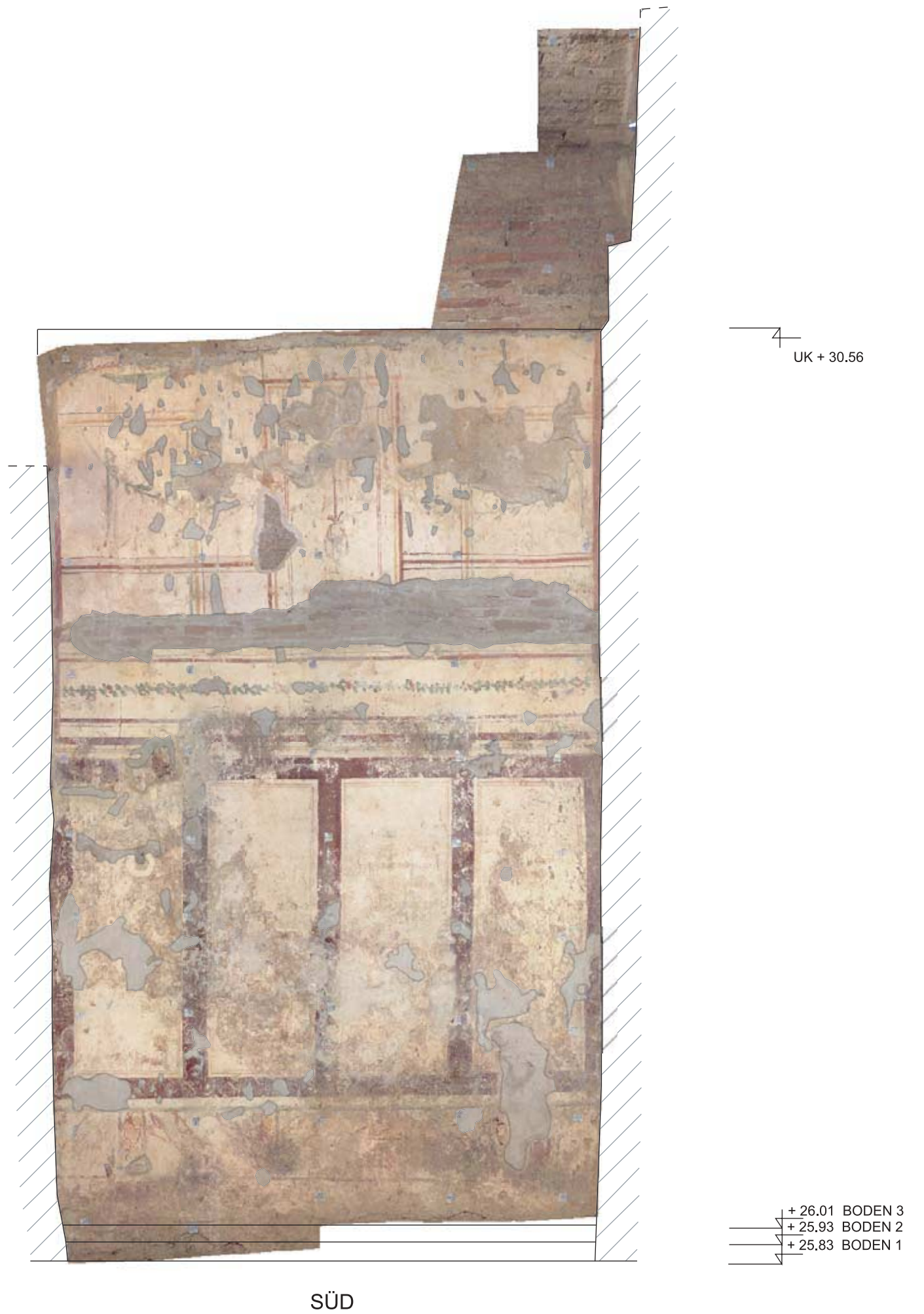
61: Bilddokumentation Raum 15, S-Wand (M 1:25)