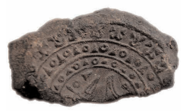
Fig. 2 The Hittite bulla from Aphek