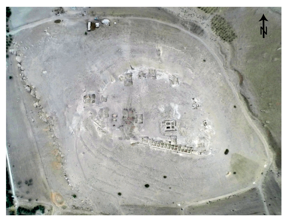
Fig. 2 Aerial photograph of Tell Abu al-Kharaz; early Iron Age compound in southern part (October 2014)

the tell.<sup>4</sup> We may assume that productive agriculture was mainly practiced with irrigation during the Bronze and Iron Ages, although rainfed agriculture may have been carried out during certain periods (see also FISCHER 2013, 468). The untillable areas are used as grazing grounds for livestock, mainly caprines (FISCHER and HOLDEN 2008, 308).