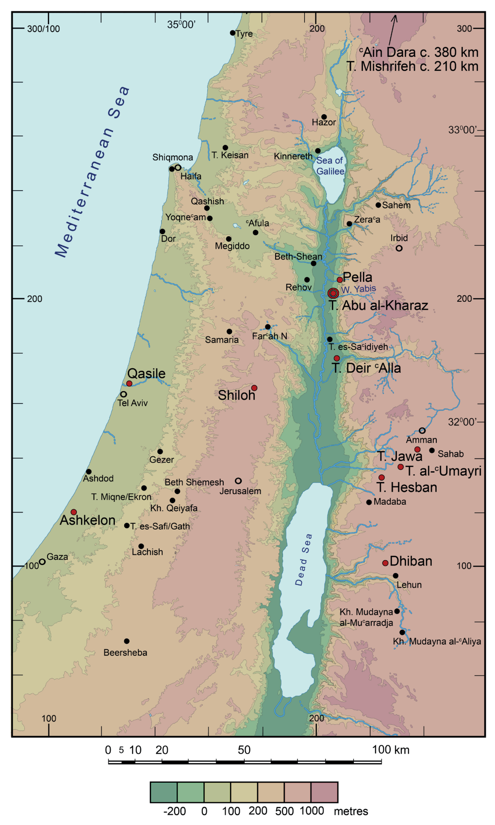
Fig. 1 Map of the Southern Levant with major Iron Age sites; sites referred to in Table 3 are emphasised (map by T. Bürge)