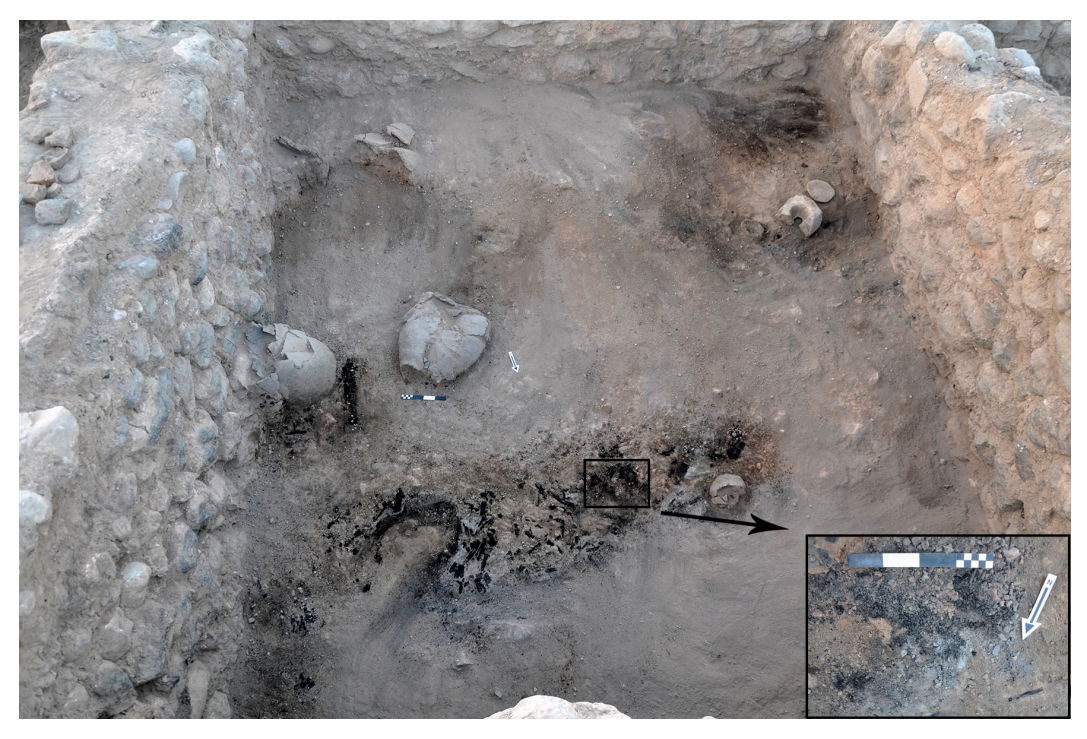
Fig. 4 Photograph of Room 19 during excavation with heaters/ovens and remains of wooden containers or installations; detail of charred grains in lower right corner

(microsperma group) of lentils ( Lens culinaris ). Grass pea, although considered animal and famine food for humans, is appreciated for its ability to grow in dry places and on poor soils. It requires boiling before eating, as it contains toxic substances (ZOHARY et al. 2012, 95). Whereas lentils and chickpeas, with a seed protein content of c. 2%, constitutes an important meat substitute in poor societies (ZOHARY et al. 2012, 87), they could also have been used as soil enriching plants and animal fodder.