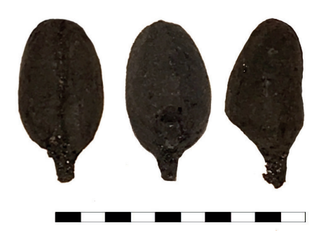
Fig. 7 Germinated grain of emmer wheat (Triticum dicoccum)

most probably were simply overlooked during hand sorting (HILLMAN 1984; JONES 1984). The ratio of weeds to grains was just 0,36%.