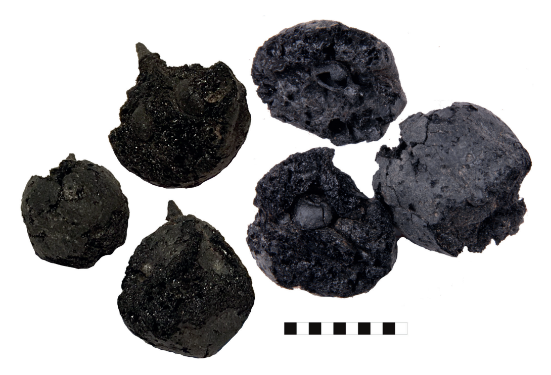
Fig. 5 Charred fruit of common grape wine (Vitis vinifera) with preserved stalks and pips

grains alone is not possible, as they can only be separated on the basis of rachis internodes, which were absent from the studied assemblage. The residue also included indeterminate wheat grains ( Triticum sp.) and thousands of damaged fragments of cereals.