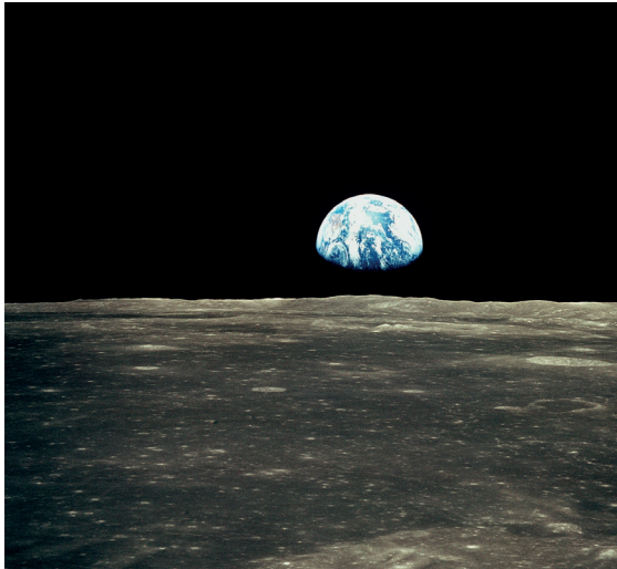
Figure 3 – Earthrise. Iconic picture of the 20 th century, mankind's first view of their own planet. Photo ID AS11-44-6550, taken 1968 by Apollo 11.