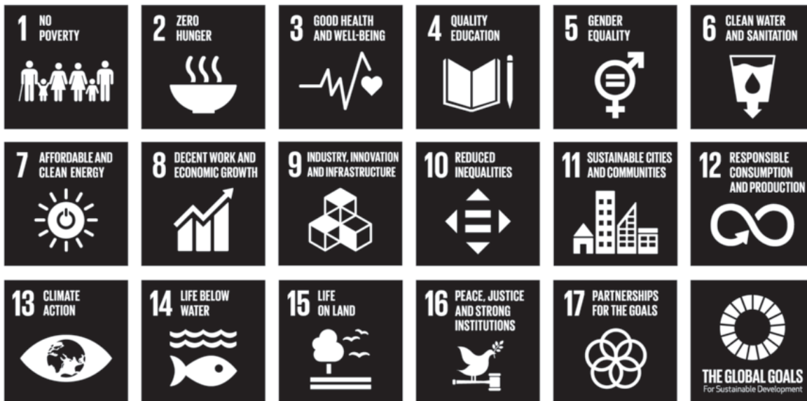
Figure 4 – Sustainable Development Goals. A global orientation towards sustainability (United Nations 2015).

However, it can take many years before just some of the conceptual and strategic considerations find their realization in regional management plans. One reason is that participative processes to define targets require time, and management plans usually cover a period of 10 years. Although minor adjustments to new policies can be implemented continuously, major amendments may be realized only in later management plans.