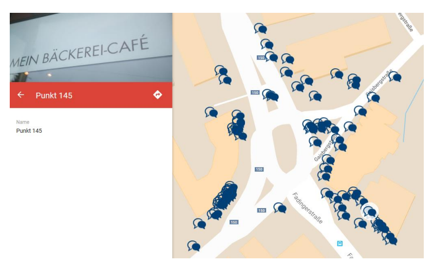
Figure 1: Illustration of one area from the map

Another click on the image allows a full-screen view. A button bottom-left allows the base map to be replaced by a satellite image or a simple street map. (All photos included in the Google-Map were taken by the author.)